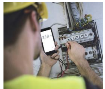
Electric Power Inspection