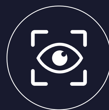
700cd/m 2 Brightness