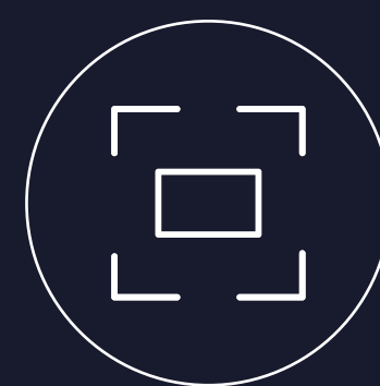
10.1 inch screen