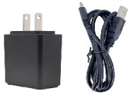
Fast charge adapter and CtoC data cable