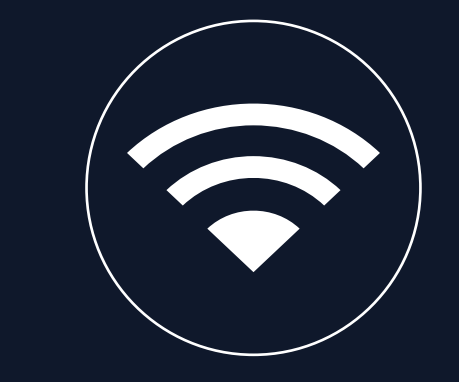
Dual frequency Wi-Fi