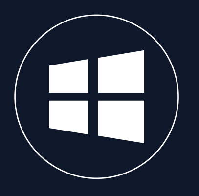
Windows 10 Operating System