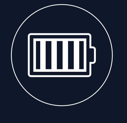
Stable power supply