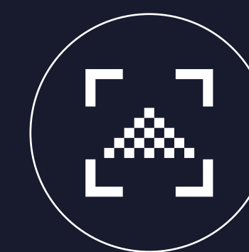
1920*1080 Screen resolution