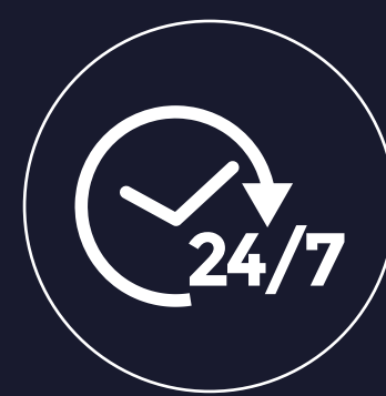
Running 24/7 without affecting reliability