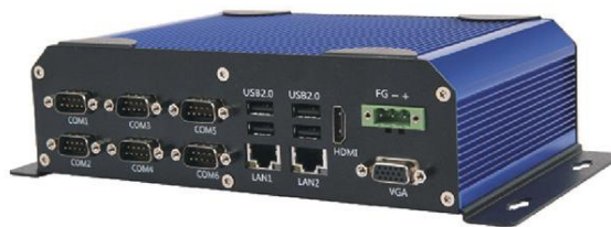
EM-MP150J Fanless Embedded PC