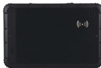
EM-T88 Rugged Tablet PC