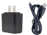
Fast charge adapter and CtoC data cable