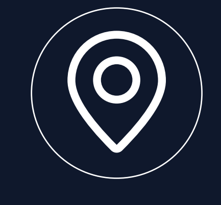
GPS/GLONASS/ Huada Beidou