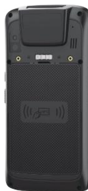
EM-T52 Rugged Handheld